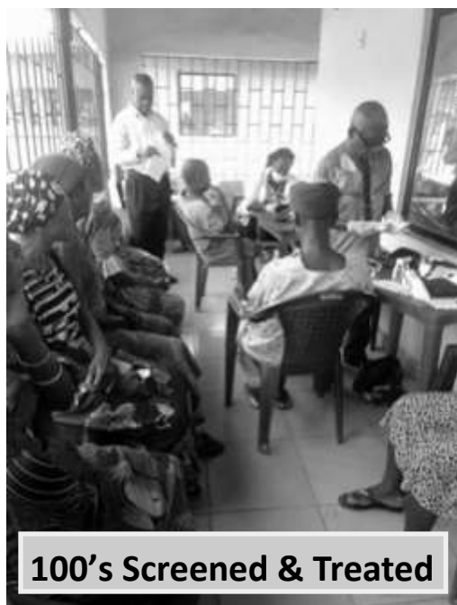
100's Screened & Treated

We recently concluded April missions in Kenya and Nigeria. Widows were fed, sick people were treated by medical professionals, and sinners prayed to receive Jesus Christ. Thank you so much for your support of this ministry, which makes all this possible!