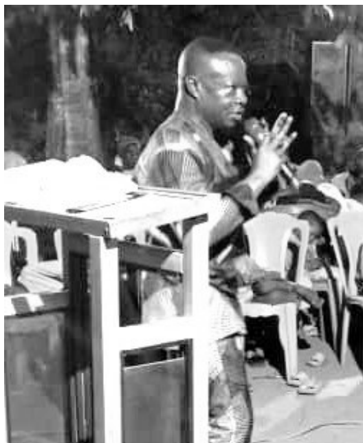
Jesus was preached and people responded