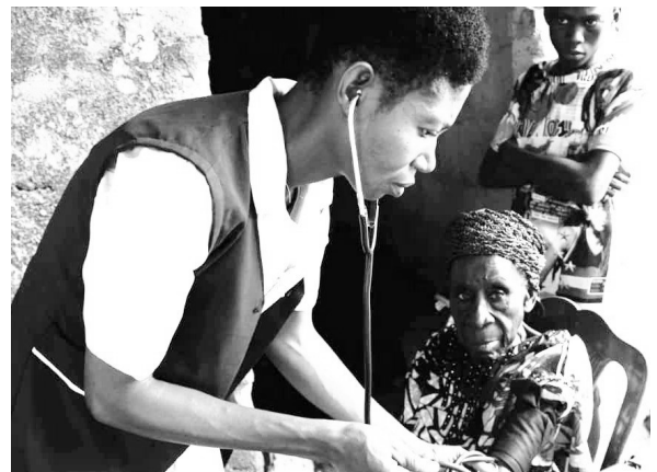
Over 300 Africans received medical treatment