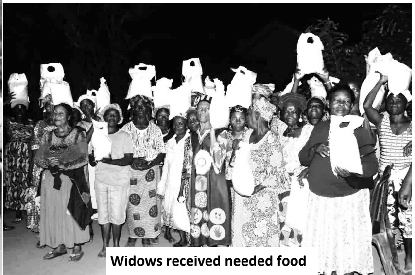
Widows received needed food