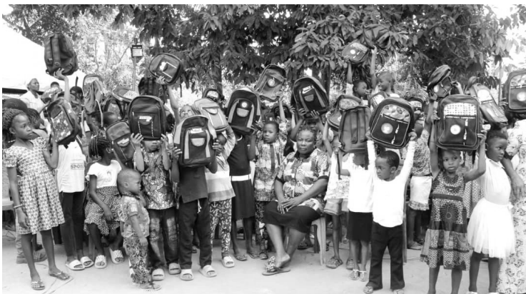
Orphans received backpacks with school supplies

God is big on ministering to people who do not have the advantages that most people do. And He calls us to feel the same way. As we do missions in Africa, we always look to help two special groups: the orphans and the widows. We provide specifically for them and let them know that they are not forgotten by our compassionate JESUS!